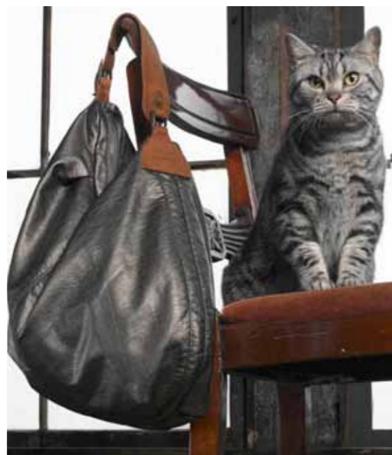
BAG AW3184 475