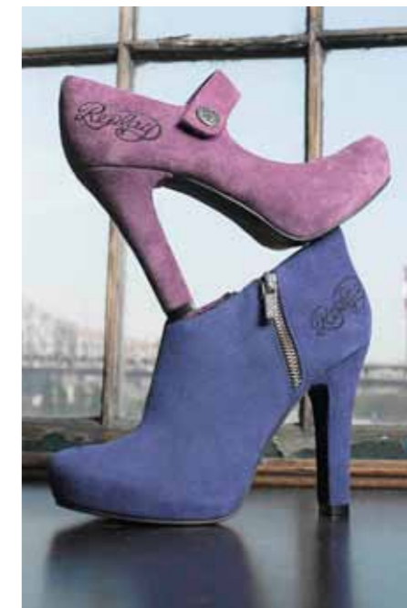
UP: HIGH HEELS GWP03 C0006L DOWN: HIGH HEELS GWP03 C0007L