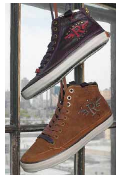
UP: SNEAKERS GWW07 C0003L DOWN: SNEAKERS GMV06 C0002L