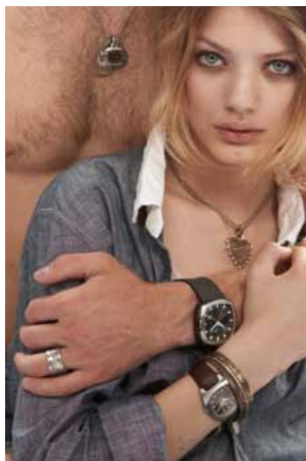
BREGJE: WATCH: RW5605ZH NECKLACE: RAC19245 BRACELET: RAB192 BEN: WATCH: RH5403NH NECKLACE: RAC19665 RING: RAR195