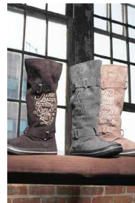
BOOTS GWW05 C00015