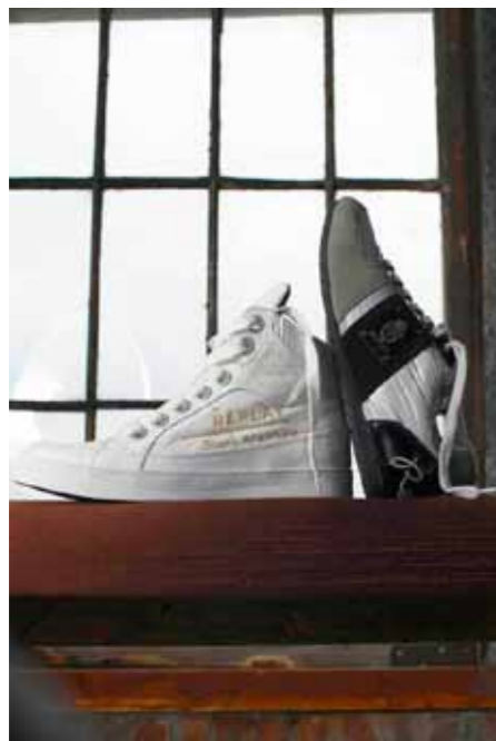
LEFT: SNEAKERS GMZ03 C0001L