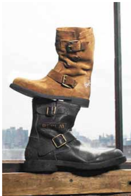
UP: BOOTS GWL02 C0001L