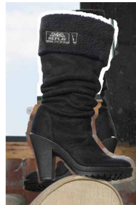
BOOT GWP04 C00035